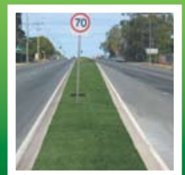
Councils and Public Areas